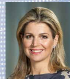
マキシマ オランダ王国王妃 (GPFI 名誉パトロン) Majesty Queen Máxima of the Netherlands (Honorary Patron of the GPFI)

Her Majesty Queen Máxima of the Netherlands has served as the UN Secretary-General's Special Advocate for Inclusive Finance for Development (UNSGSA) since 2009. As Special Advocate, she is a leading global voice advancing universal access to affordable, effective, and safe financial services. Collaborating closely with global and national partners, she raises awareness, encourages leadership, works to break down barriers, and supports action to expand financial inclusion. Queen Máxima is also honorary patron of the G20's Global